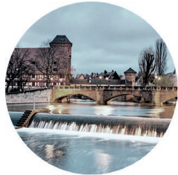
Nuremberg | Fürth